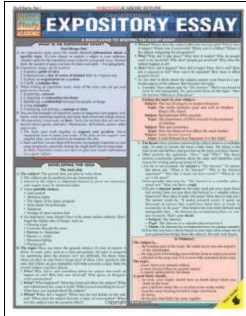
Filesize: 9.58 MB