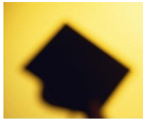
The Black Cat (University Study Edition) Edgar Allan Poe